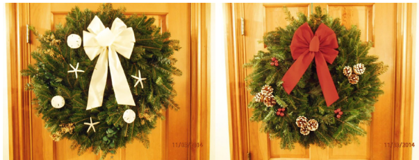
Seashell Wreath $25.00